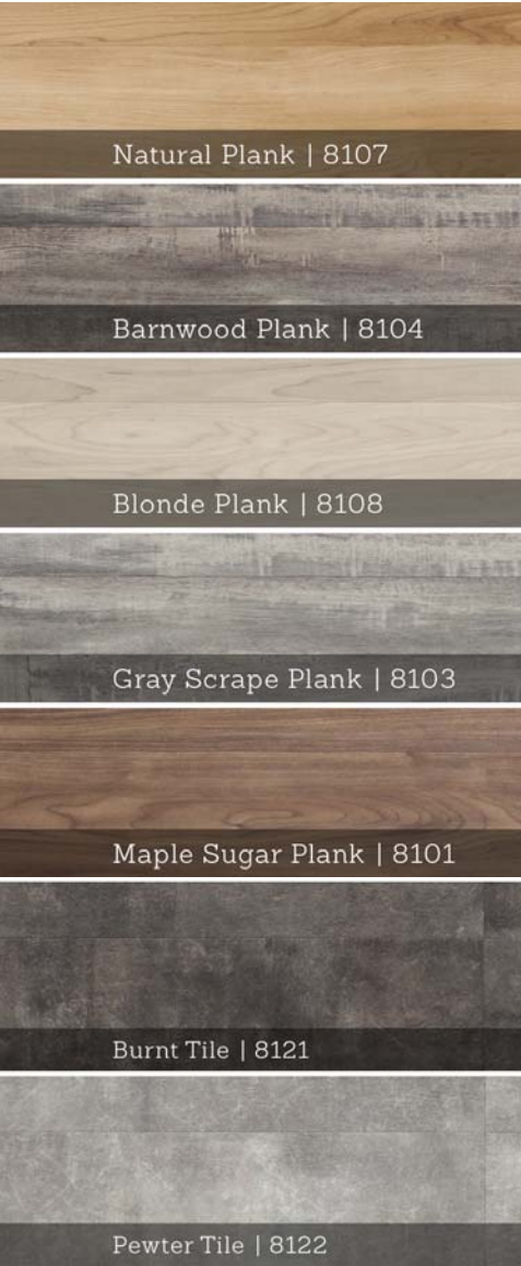
Natural Plank | 8107